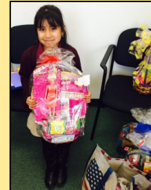
Youth Council and McG members organize baskets.

Thanks to Sacred Heart University volunteers, McGivney members were able to celebrate Easter with a giant Easter egg hunt! The SHU students organized games to play and set up the hunt. Everyone had a blast! In addition, thank you to everyone that contributed to the Youth Council's Easter Basket Drive. McGivney members were able to give back during this holiday by making baskets for children at Bridgeport Hospital.