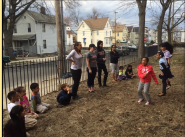
SHU volunteers and members play Simon Says.