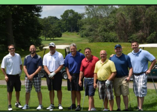
Golfers enjoy the beautiful day!

The event was a great success! The tournament nearly sold out with more than 140 players in attendance. Prizes and a raffle kept the day exciting! Golfers had a great time and raised nearly $25,000 to support the educational programs at the McGivney Center. Thank you to all the sponsors and golfers that made this the most successful year yet!