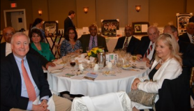
Guests enjoy dinner and a silent auction!