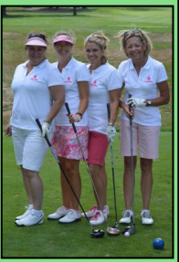
Team Pink Pom Pom Project!

The event was a great success! The tournament nearly sold out with more than 140 players in attendance. Prizes and a raffle kept the day exciting! Golfers had a great time and raised nearly $25,000 to support the educational programs at the McGivney Center. Thank you to all the sponsors and golfers that made this the most successful year yet!