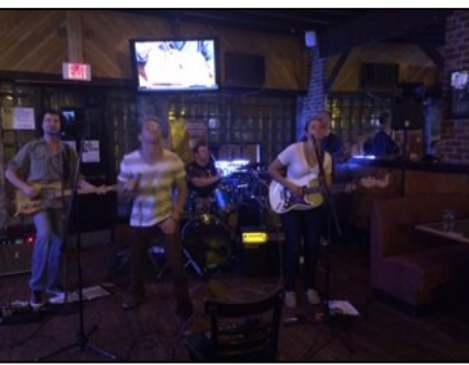
The 1995 plays '90's rock favorites!

Thank you so much to The 1995 for performing and to the Windmill Tavern for hosting us!