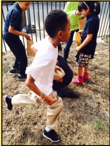
McG members hunt!

Thanks to Sacred Heart University volunteers, McGivney members were able to celebrate Easter with a giant Easter egg hunt! The SHU students organized games to play and set up the hunt. Everyone had a blast! In addition, thank you to everyone that contributed to the Youth Council's Easter Basket Drive. McGivney members were able to give back during this holiday by making baskets for children at Bridgeport Hospital.